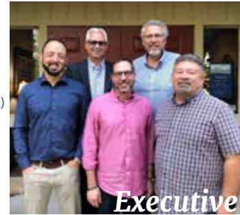
Executive Leadership Team

There is nothing wrong with this expectation or using wisdom in making decisions, except sometimes God tells us to, "Go to a land I will show you," (Genesis 12: 1) and not a land I have shown you. "Follow me and I will make you fishers of men," (Matthew 4:19), not follow me because I have made you fishers of men. The picture becomes clearer as we follow.